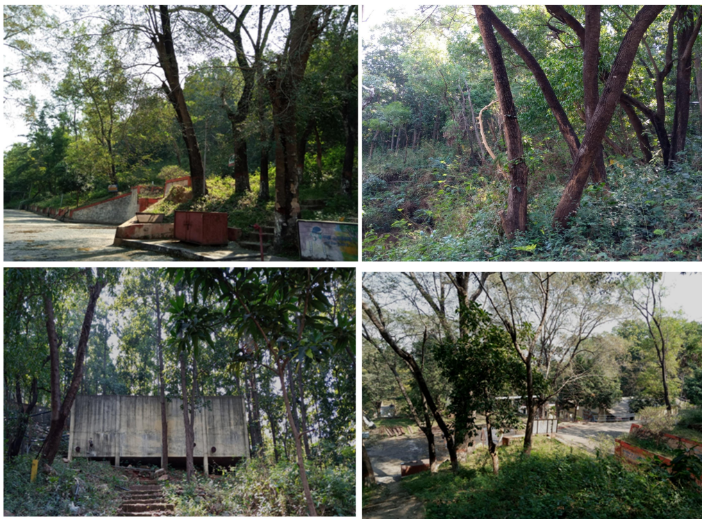
Photograph showing plantation in and around Bhatin mines